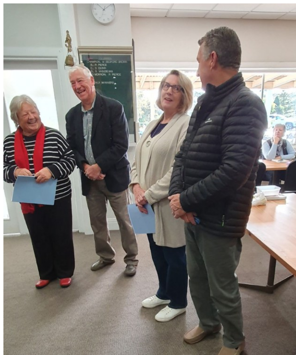
Our newest members