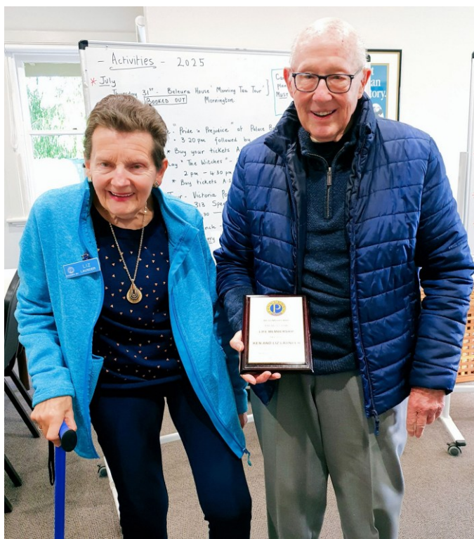
Our new Life Members