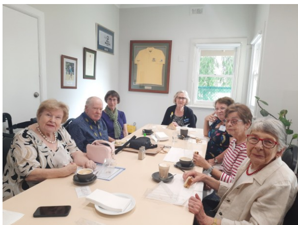
Some of us stayed for lunch after the meeting