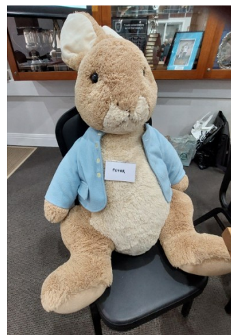
Our new Secretary