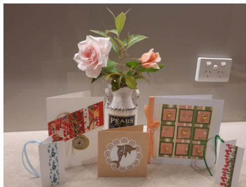
Some of the ladies' beautiful creations