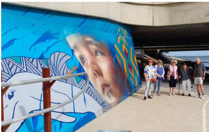
Mural at Patterson River