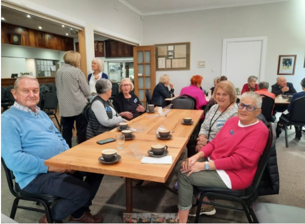
Lunch after the meeting