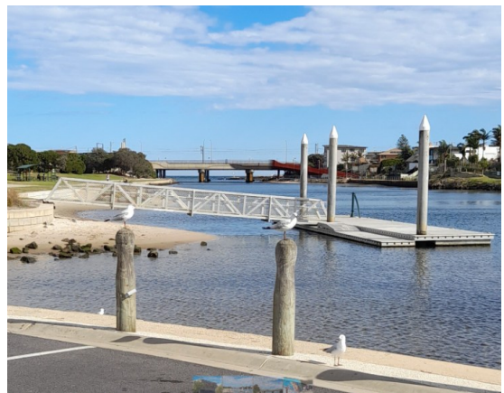
Jetty with wheelchair sling