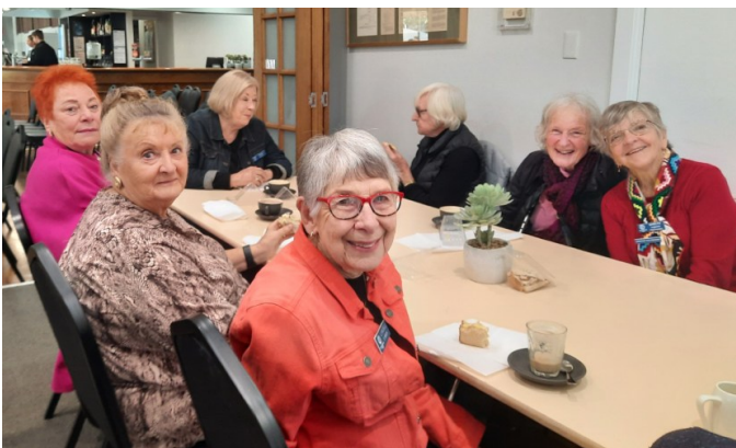
More happy lunches