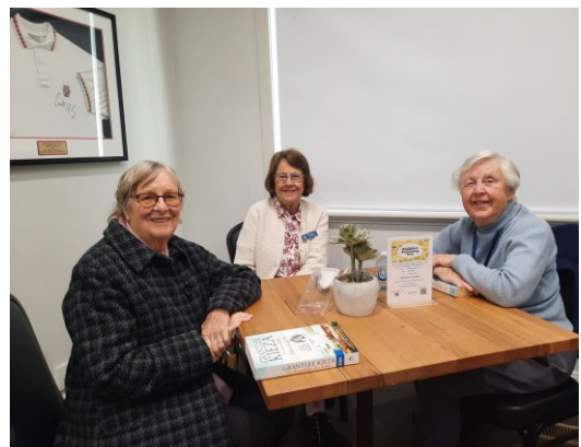
Still more happy lunches