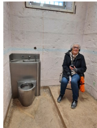
Pentridge 5-star room