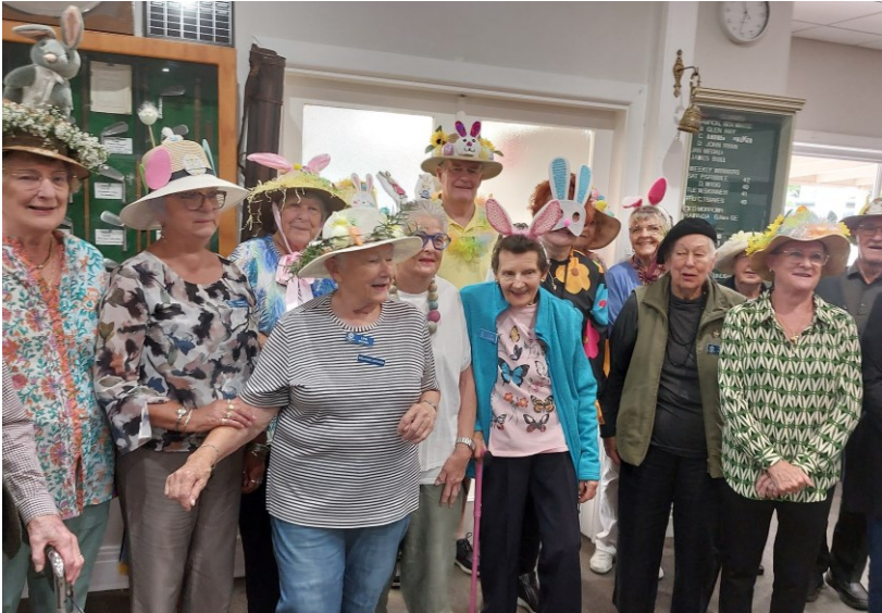
"In your Easter bonnet, with all the frills upon it."