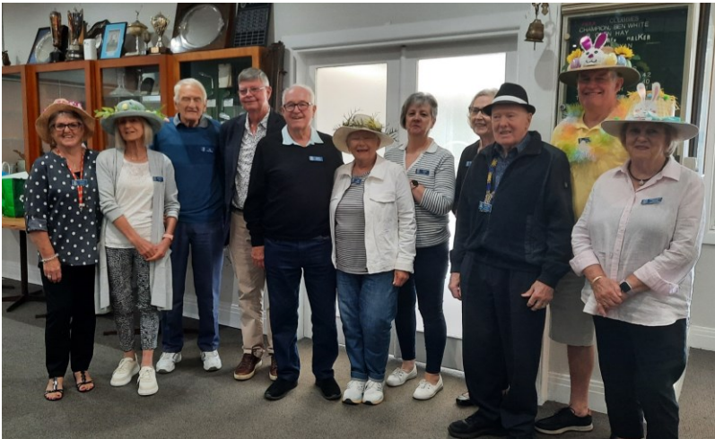
New Committee 2024