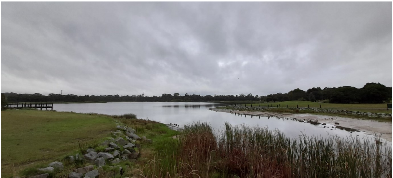
Karkarook Park lake