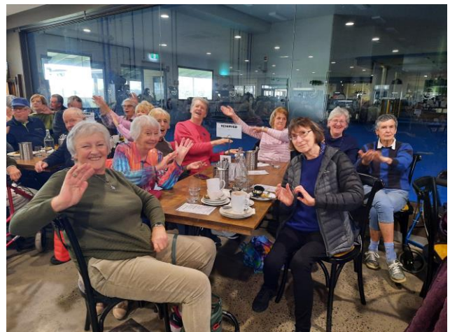
Girls having a fun time