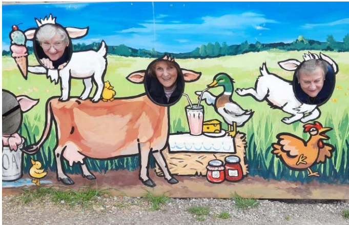
Strange looking farm animals at Caldermeade Farm