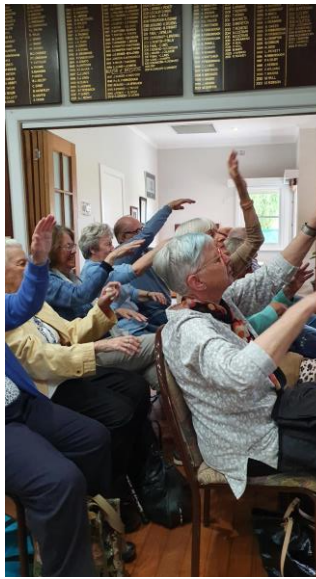
They're not praying, but emulating the Aussie Crawl, as used by our guest speaker in his epic swim