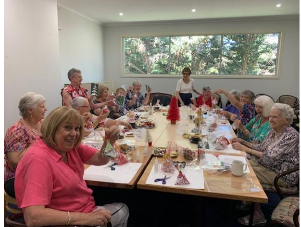
Craft group – making Xmas decorations