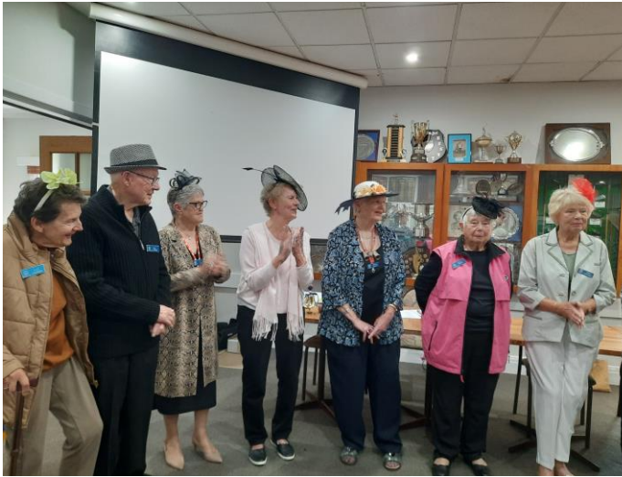
Some of the entrants in the Fashions on the Field at the General Meeting.

Note: You can enlarge the page by pressing Ctrl and rotating the wheel of your mouse.