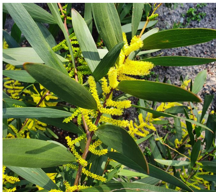
Spring has sprung at last ...