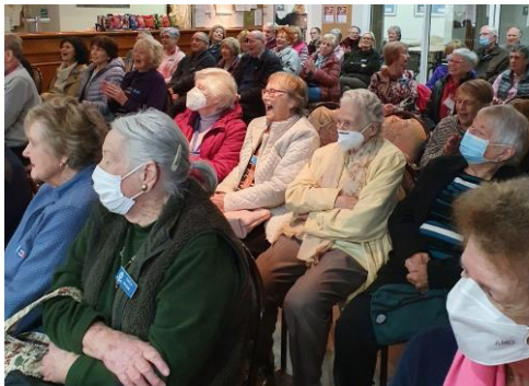
General Meeting members