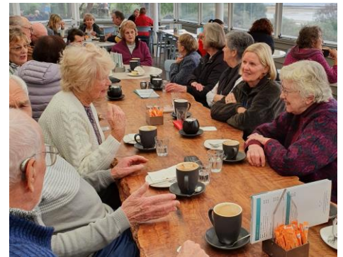
Coffee, Chew & Chat