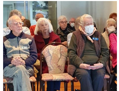
More General Meeting members