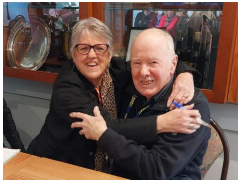
Secretary & Editor embracing their roles