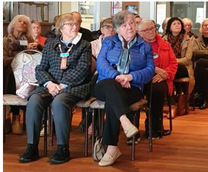
General Meeting members