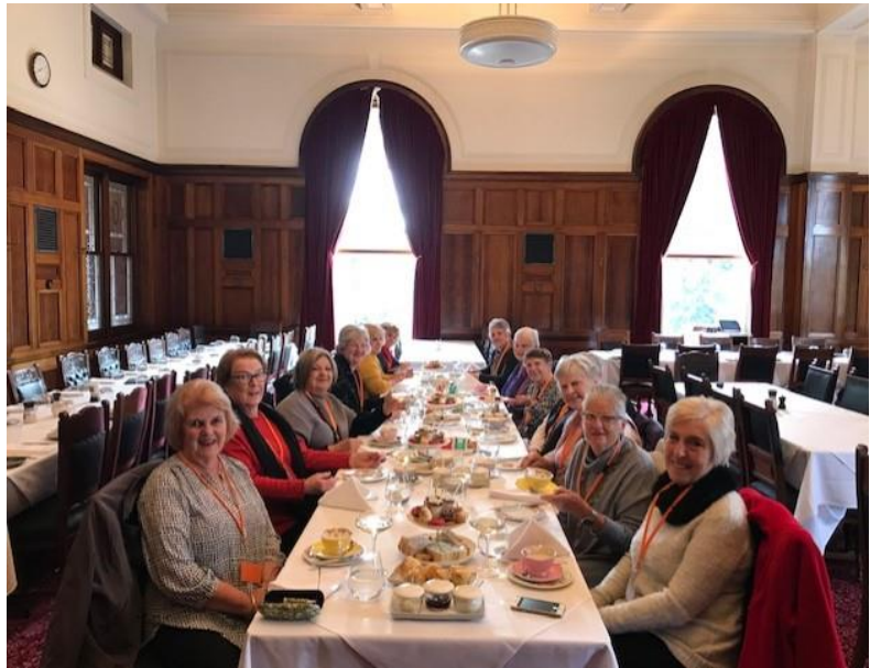
High Tea at Parliament House in August