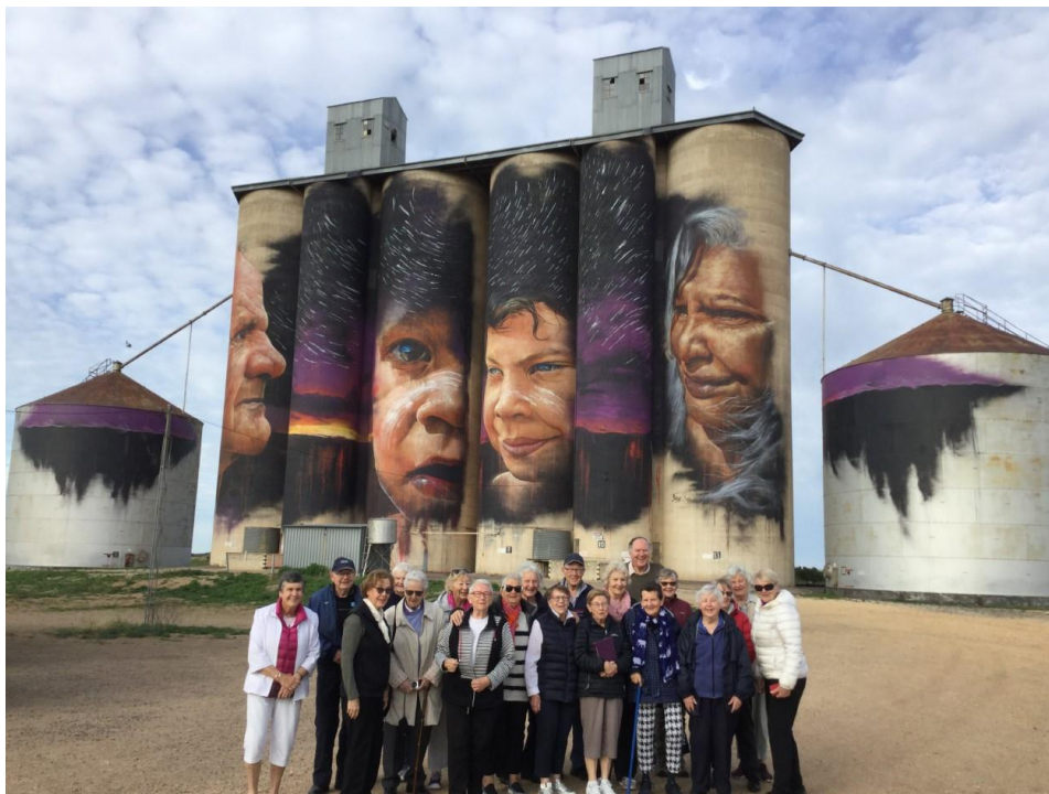
Our members at the Sheep Hills silo murals depicting local Elders painted by Melbourne artist, Adnate