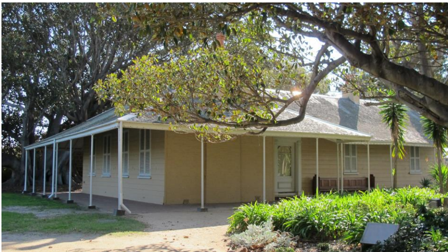
Black Rock House was built in 1856 for Charles Ebdon, Victorian squatter, parliamentarian and leading citizen. It is located in Ebdon Avenue, Black Rock.