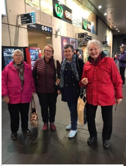
The intrepid Walking Group travelled by train in June to see the Royal Portraits Exhibition in Bendigo.