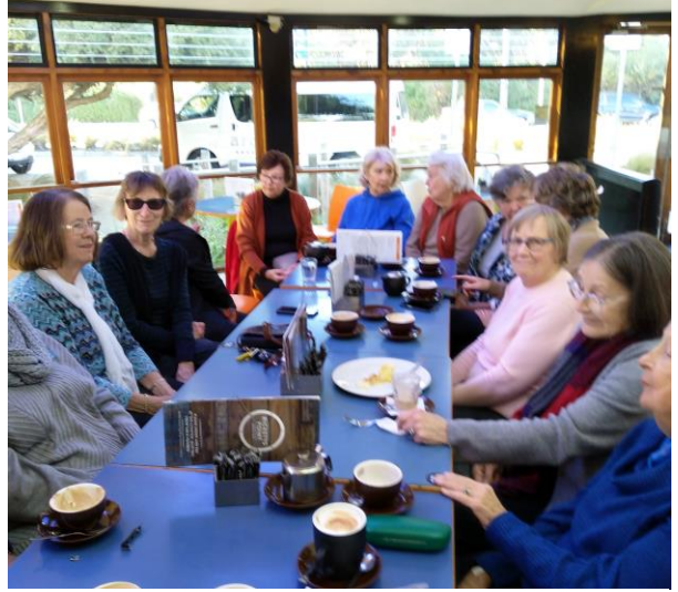
Seventeen members enjoyed catching up over coffee at the Ricketts Point Café last month. It looks like this venture will be a regular activity each month.