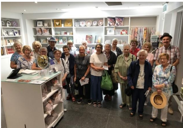
Visitors to the Johnson Collection last month