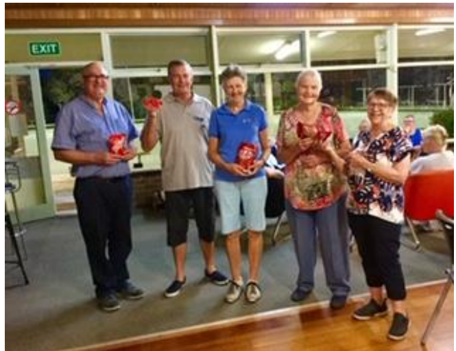
Barefoot Bowls prize winners